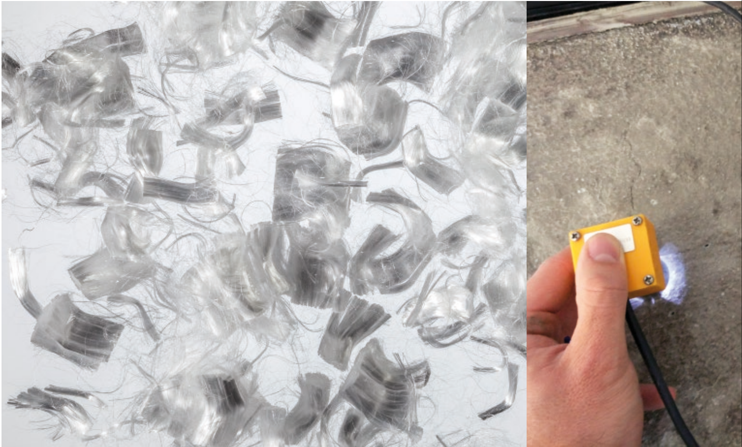
Fig. 1 / 3 in 1 solution

Left without Crackstop M, right with Crackstop M