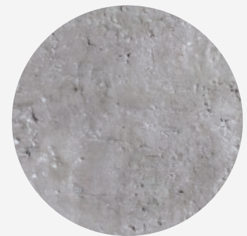
Fig. 4 / Reduced plastic shrinkage

Left without Crackstop M, right with Crackstop M