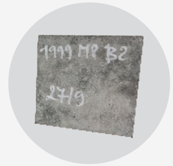
Fig. 3 / Enhanced freeze-thaw resistance

Left without Crackstop M, right with Crackstop M