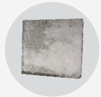
Fig. 5 / Minimized water permeability

Left without Crackstop M, right with Crackstop M